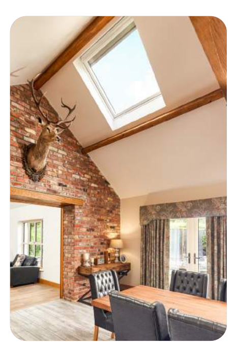
To see other Keylite Case Studies, visit our website: keyliteroofwindows.com/case-studies