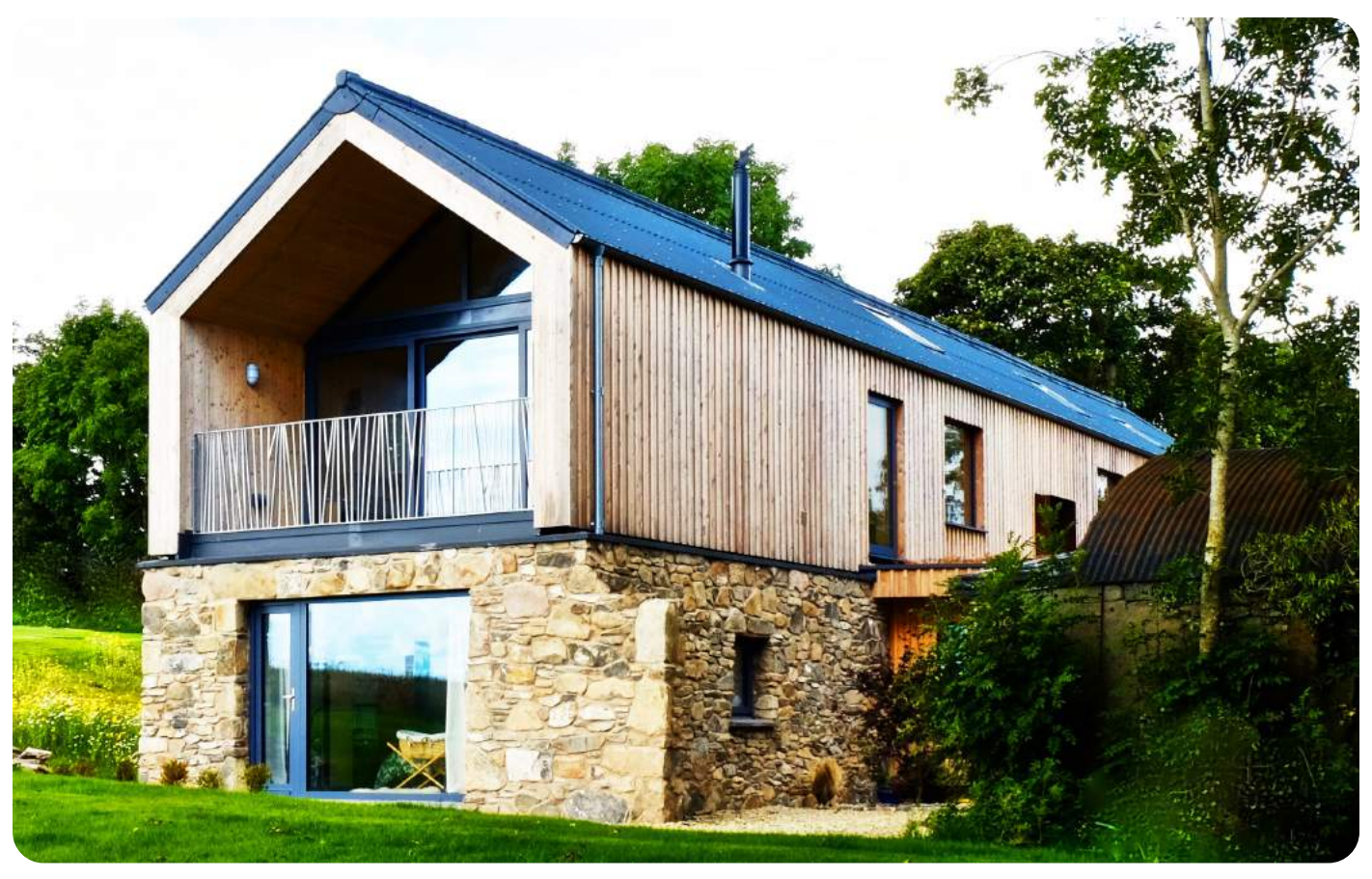
County Down Barn featured on the Channel 4 series Grand Designs. Awarded the prestigious House of the Year award by the Royal Society of Ulster Architects in 2018.