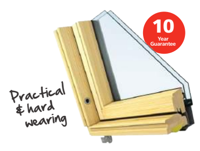
White Painted Pine